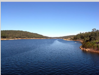
Lake O'Connor still provides drinking water for the towns along the pipeline to Kalgoorlie.