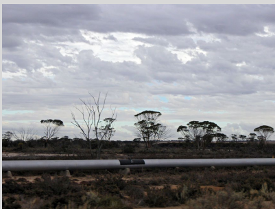
The Goldfields Pipeline runs along Great Eastern Highway in WA